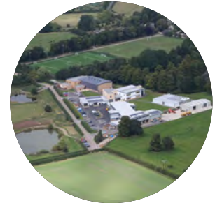
Brooksby Campus Part of the SMB College Group

SMB College Group continues to invest in dedicated new college routes, making it even easier to access the course of your choice. SMB College Group is accessible from all parts of Leicestershire and surrounding counties. Alongside our direct routes into college, you will also find an excellent network of public bus services into our campuses. Our direct routes are now available to all SMB College Group students including degree level. You will have to apply for a new travel pass for each year of your chosen course. All annual passes cost £750 payable in full or in instalments by direct debit.