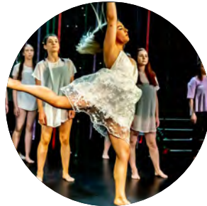
Melton Campus Part of the SMB College Group